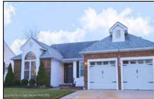
47 Trent Drive

ADK will help you SELL your Home for MORE...FASTER!