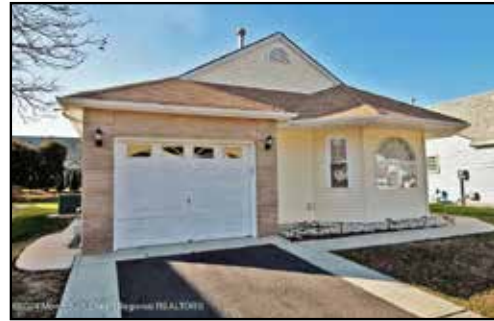
94 Narberth Way