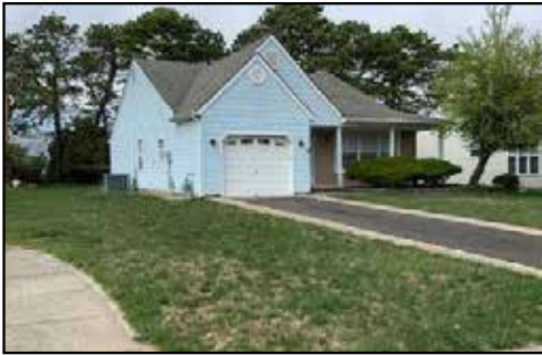
28 Swindon Court