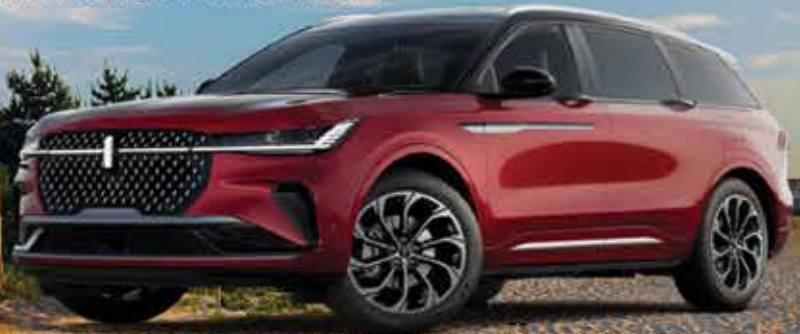
2024 Lincoln Nautilus

"Exit 63 off the GSP" 375 NJ-72 Manahawkin NJ 08050 888-806-8105 Shop online here bit.ly/CausewayLincoln