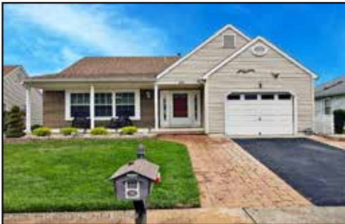
40 Portsmouth Drive